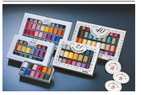
Brother offers a variety of embroidery thread #including metallics and flesh tones.